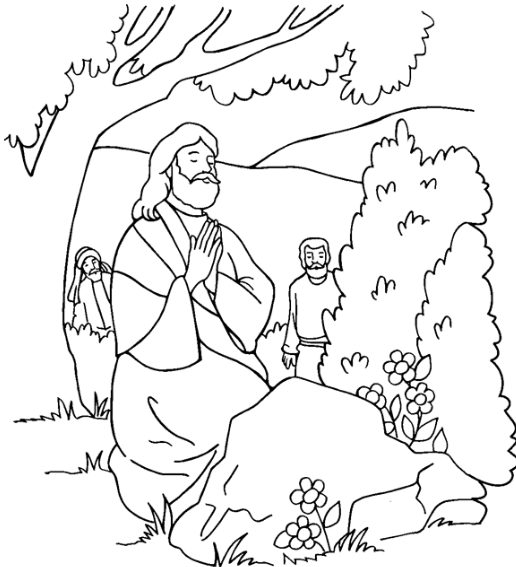
Jesus prays in a quiet place